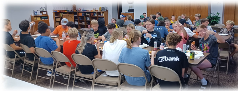
Confirmation Begins Each Wednesday with Homemade Pizza

Each confirmation student is expected to attend worship in-person at least twice a month (all year round) or submit at least 3 on-line sermon notes each month.