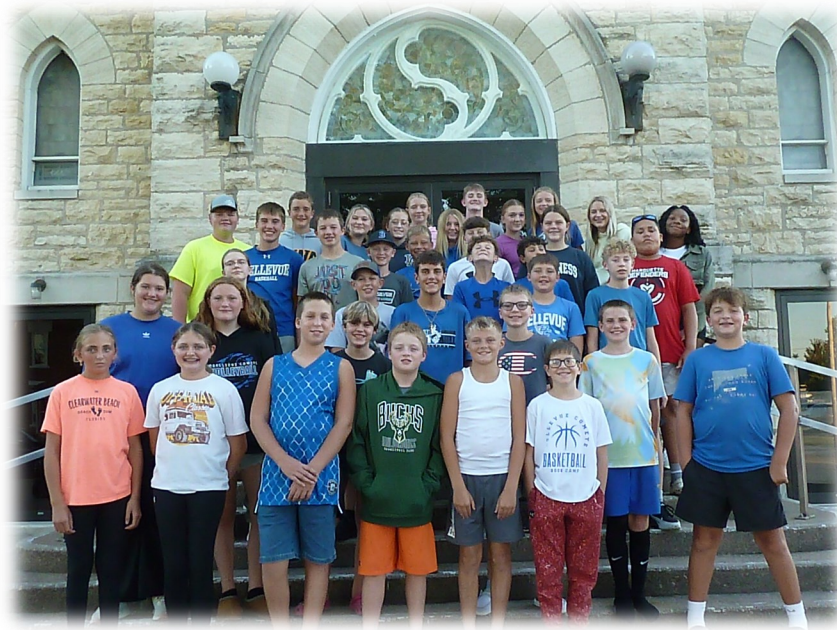
2024-25 Confirmation Students—First Day of Confirmation